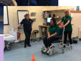
VISIT FROM DRI