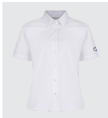
Twin Pack Shirt or Blouses