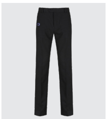
Trousers or Skirt